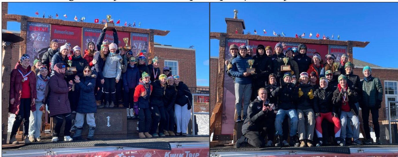
Above, from left: 2026 Midwest Collegiate Cup Women's (SOC (1); UWM (2); UMD (3)) and Men's (UWM (1); SOC (2); UMD (3)) podiums.

Badger Men defend second Championship title; hattrick for Ole Women